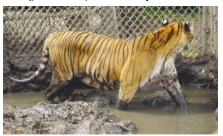
Flatrock: Tiger in mud and feces

Then it was back to Flatrock where we took one tiger and four leopards. We have taken in 13 cats because of desperate circumstances in both situations. This has put us in a position of needing more help with fencing, building materials, and labor. With winter approaching housing must be completed in a timely manner.