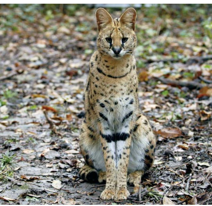
Serval - Mirage

While there are four servals who call the EFRC home, you might have a difficult time spotting them in their habitats, as servals are shy and elusive, especially