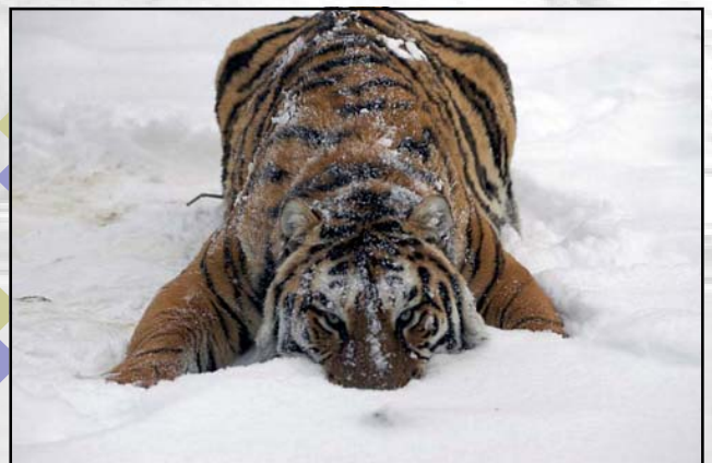
Big Boy in the snow