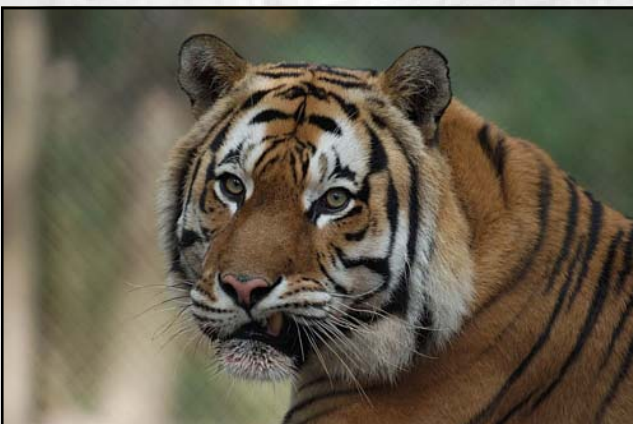
Raja in his usual pose

We ask that you make the best gift you can consider as we near the end of the 2007 tax year. We are grateful for the generosity of so many and thankful for all that it makes possible for our cats.