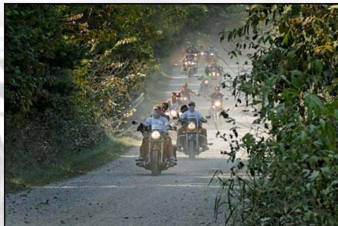
Over 100 motorcyclists visited the EFRC on September 23 for the first ever “EFRC Rescue Ride”, which raised over $2,000.