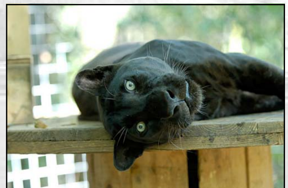
Sinbad (male black leopard)

We thank you, in advance, for helping to make this important part of the EFRC a reality.