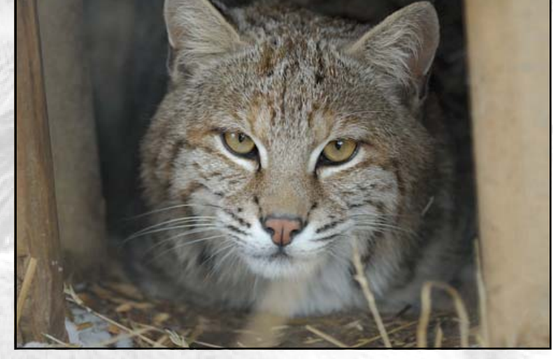
Alex is a beautiful bobcat

Bobcat Facts: Bobcats are elusive and nocturnal. They roam throughout much of North America and adapt well to such diverse habitats as forests, swamps, deserts, and even suburban areas. Bobcats usually hunt small game such as birds, rabbits, mice and squirrels.