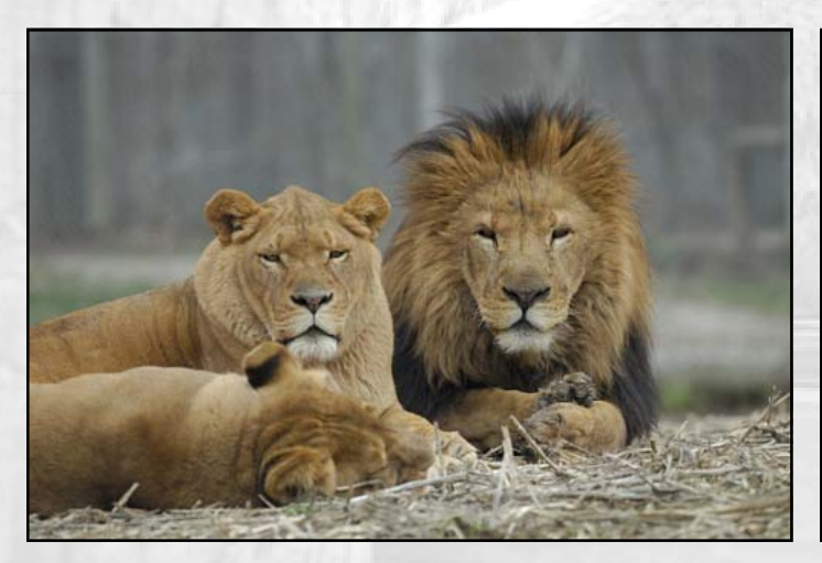
Rake and Wedge on March 21, 2008

* Included a one-time payment of $22,951 from the U.S Fish & Wildlife Service.