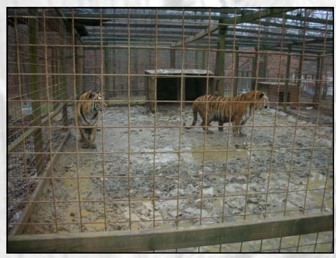
Sumara and Sumira in the mud in Kentucky

After two adult male tigers escaped from their enclosure twice in less than a week we were contacted by their panicked owner in Beaver Dam, Kentucky. Realizing the urgency of the situation we agreed to come for the cats immediately despite major snow and ice storms and the difficulties of assembling a crew with no notice. Preparing to leave the next morning we were halted by a broken lift gate on our rental truck. By the time the truck was replaced our trip was postponed for 24 hours and the tigers had escaped for the third time.