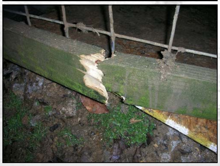
The cracked support after the first dart