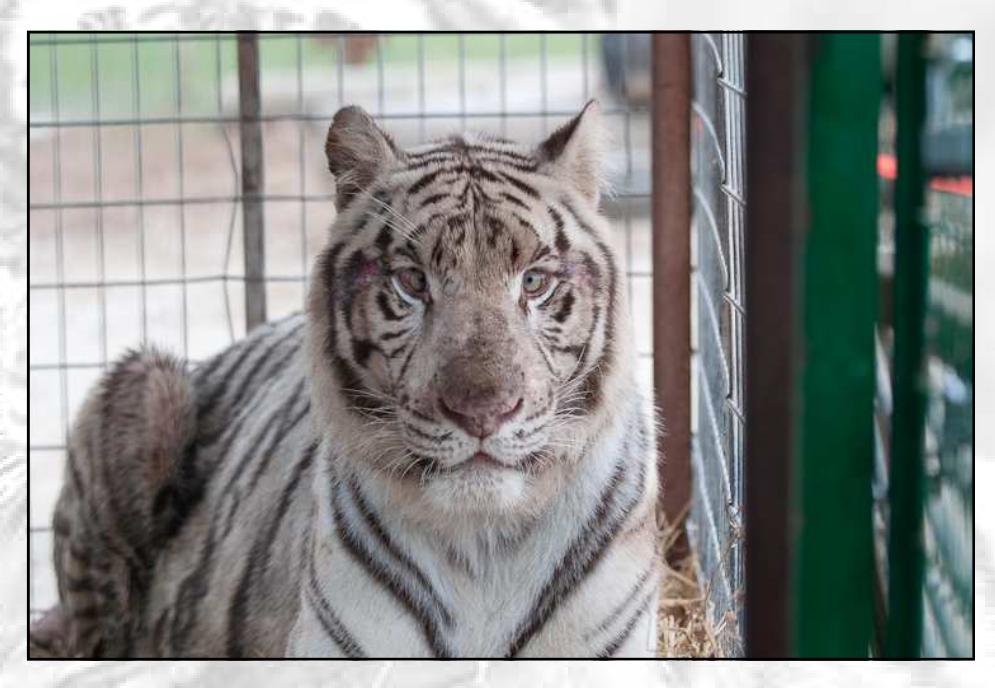
Mickey, a white tiger from Oklahoma, is cross-eyed. He is awaiting a permanent habitat at the EFRC, but is now receiving a nutritionally proper diet.

Our thanks to Clear Lake Veterinary Hospital for always being there for our cats!