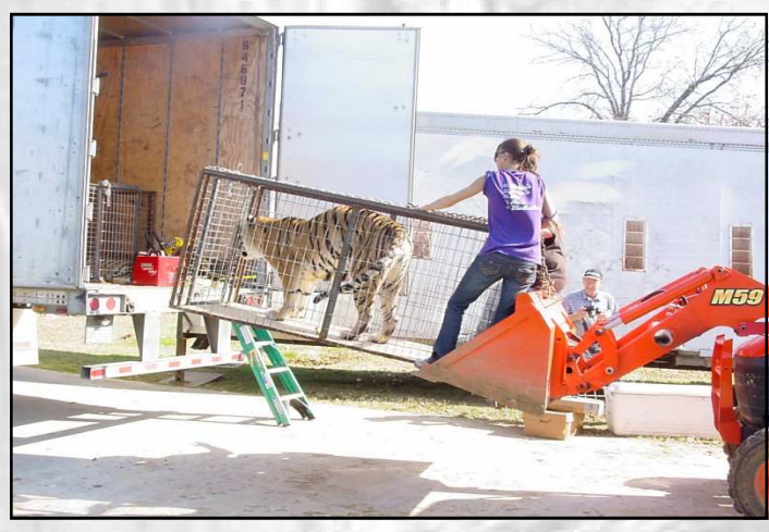
EFRC staff loads one of the tigers for transport

Ten tigers from a traveling animal show, three of whom were involved in the 2003 death of a young woman in Oklahoma, were rescued in early November. The animal show was closed by federal authorities after the "extraordinarily hungry" tigers, who had not been fed for four days, "ripped off and carried away her arm" in a "feeding like frenzy" when they reached through an 8" opening in the cage according to a USDA document. (USDA document: http://www.usda.gov/da/oaljdecisions/070322_AWA_04-A032.pdf)