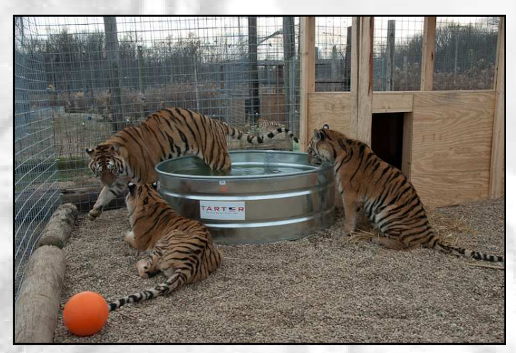
The new home of Lincoln, Kennedy and Killer

Housed temporarily in the meat processing building, they have been continually fed and they are all gaining weight. Mickey, the white tiger, is cross eyed and may face other medical challenges and Temple has obvious difficulties walking and