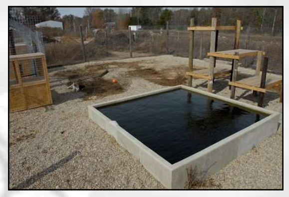
New habitat for 6 of the 13 Texas tigers

The moving of a large group of tigers is a complex and costly endeavor. It took nine people four days and cost over $6,000 to move these cats. Keeping the cost to a minimum was only possible because of people volunteering their time, and Kenworth of Indianapolis for donating the truck for the trip. A $1,000 transportation grant from the FCF Wildcat Safety Net Fund also helped make this rescue possible.