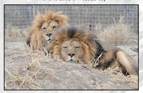
Thor and Zeus at the EFRC this fall