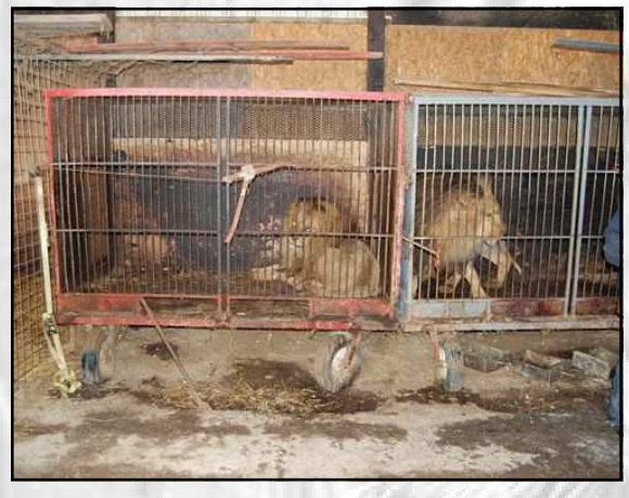
Thor and Zeus on rescue day

Since one photo is worth a thousand words we have two to share with you!