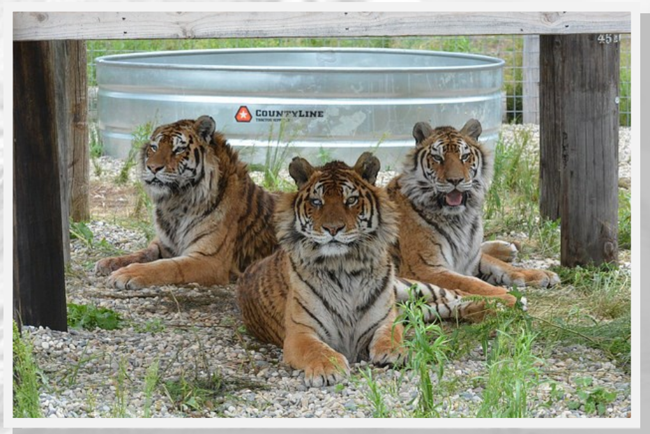
Three of our newly rescued tigers from the JNK facility in their new enclosure

The Rescue Center took six tigers during the rescue. Four of the tigers appeared underweight, two have cataracts and several have dental problems. While all of the tigers successfully arrived at the Rescue Center, a small male died the morning after