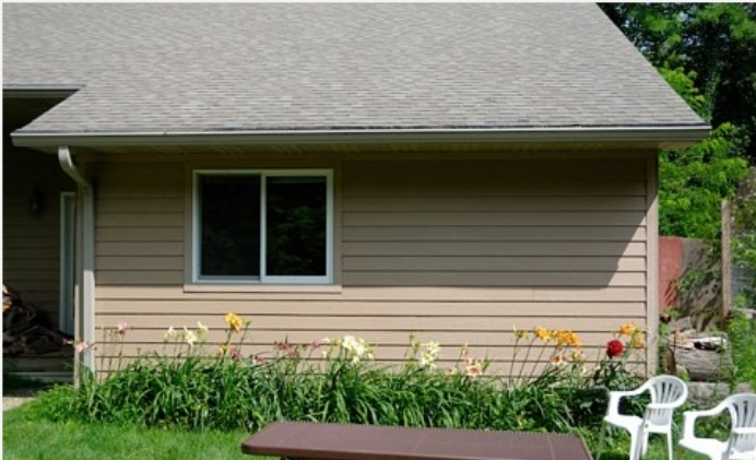
A GREAT GIFT FOR YOUR CAT LOVER!