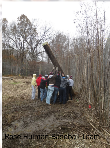
Rose Hulman Baseball Team