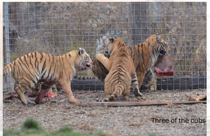
Three of the cubs