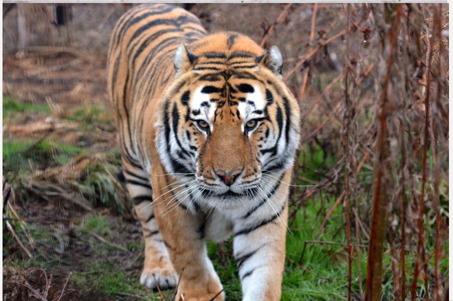
New Boy in Town

The tigers were taken in at a young age by a couple not willing to see them euthanized because of broken legs. Provided with veterinary care and nursed back to health the couple built one of the most beautiful tiger cages ever seen on a rescue. Located on the edge of a rock quarry this large enclosure was filled with trees, large boulders, natural caves and water pools.