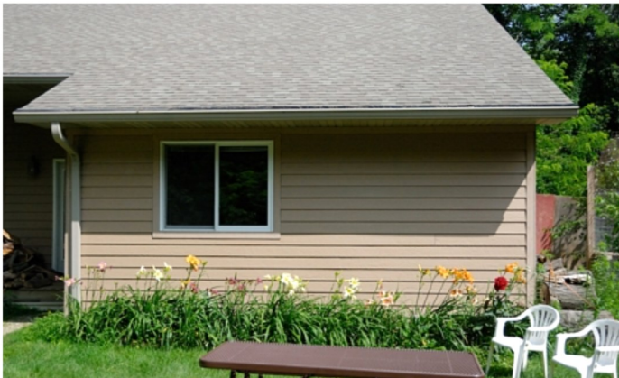
A GREAT GIFT FOR YOUR CAT LOVER!