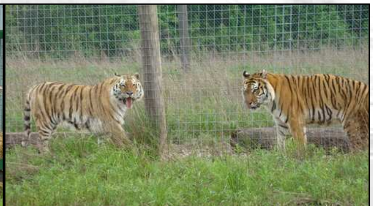
Father and son in their new home