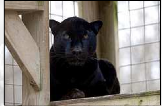
Brumby, a black leopard, benefitted from a root canal thanks to the PEIVDF.

The EFRC, its staff and Board are grateful for this rare and generous opportunity provided by the PEIVDF.