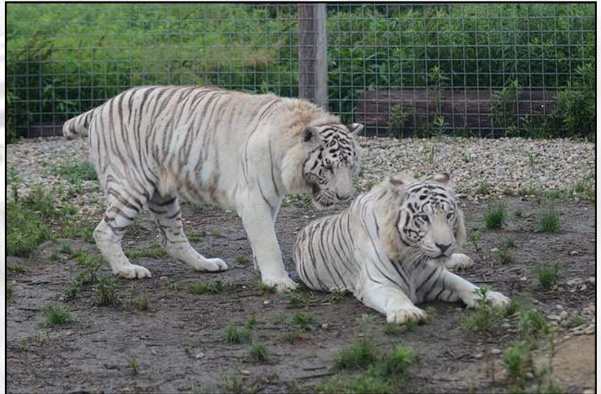
Storm and Pearl

We are pleased to report that all four cats are now in their permanent habitats and, as this spring photo demonstrates, are very much enjoying their new lives at the EFRC.